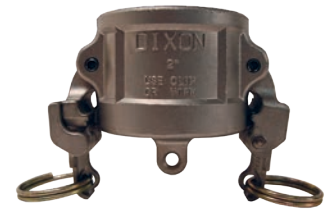
316 stainless steel