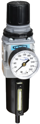
with metal bowl